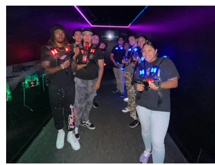
Jobe residents & staff gear up for a laser tag match.

For the past decade, Jobe's residents and staff have actively participated in the sister's annual Day of Service community event, joining forces with various other groups to enhance the beauty of their ranch. This event stands as a testament to Jobe's commitment to community service, serving as one of the most prominent ways our residents give back to the community. Each year, the event fosters a sense of camaraderie and shared purpose among participants, as they work together towards a common goal. The rewarding experience not only enriches the local environment but also strengthens community bonds, reinforcing the spirit of cooperation and generosity. Jobe is eager to continue this cherished tradition, embodying the essence of giving back year after year.